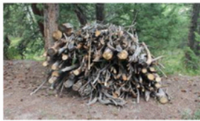
ONE neat pile per property