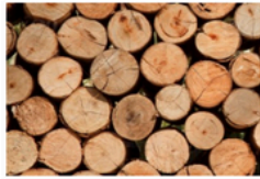
4 inches or less in diameter