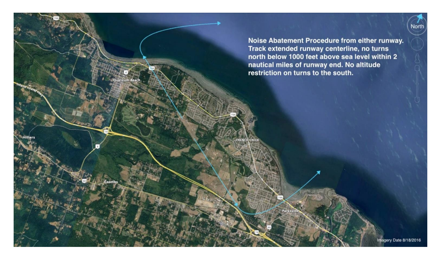
Figure 3 Noise Abatement Procedure (NAP) for turns to the North pursuant to CAR 602.105